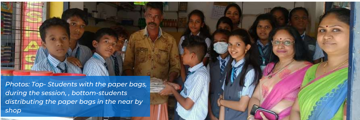
Photos: Top- Students with the paper bags, during the session, , bottom-students distributing the paper bags in the near by shop