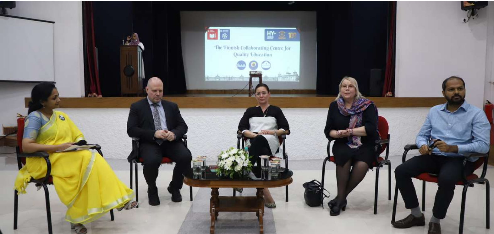
Photos: Glimpses of the panel discussion on Redefining Education: A Finnish Perspective. Bottom left and right: Glimpses of the Inaugural ceremony.