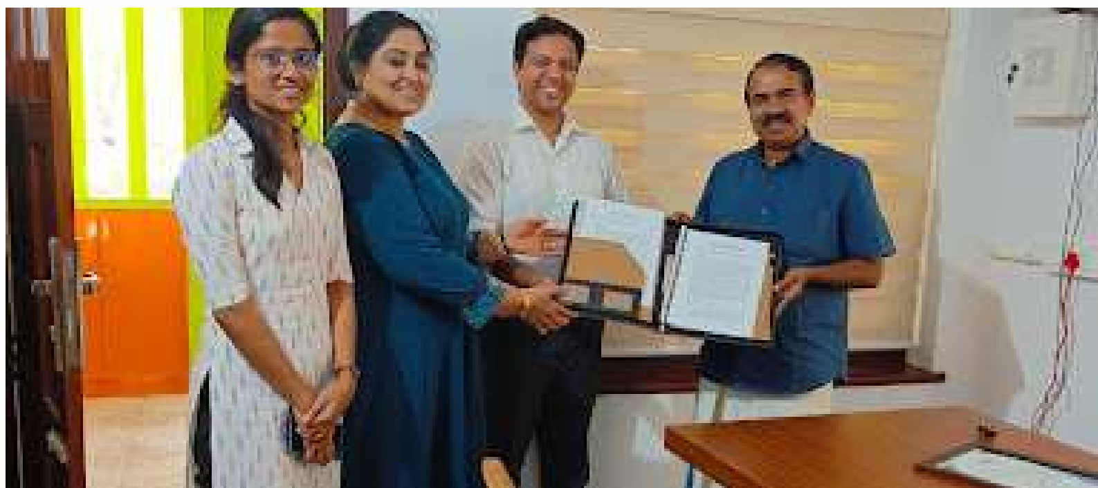
Photo: Team VentureVillage and Team Baby Roots posing for photo after signing of MoU

VentureVillage has signed a Memorandum of Understanding with Baby Roots, an institution that provides Early Childhood Education and Care (ECEC). Baby Roots is based out in Kannur. Baby Roots as an organisation gives priority to activities related to the intellectual development of children from the age group of 18 months to 6 years and provides a learning environment to improve the sensory and motor developments, communication skill, cognitive abilities as per developmental milestones.